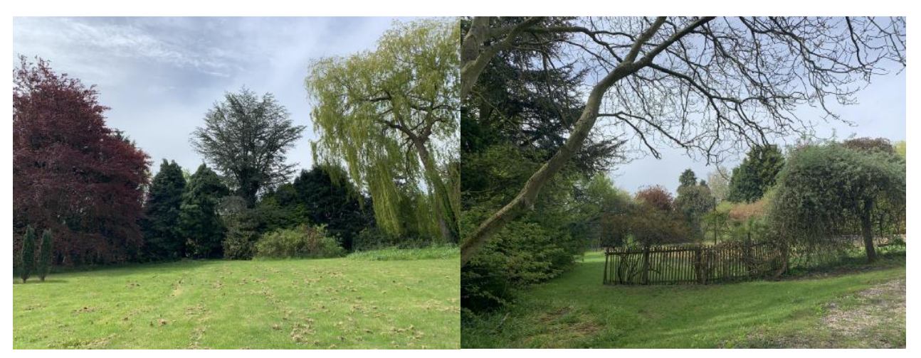
Figure 3 - Site Photos of Eastern and Southern Boundaries

I note concerns raised by locals and the parish council relating to light pollution from the dwelling and the impact this will have on neighbouring properties. The Parish have specifically raised a concern that the length of the property, coupled with it sitting on a hill and with the design showing large windows at first floor will result in light pollution and intrusion for neighbours. Firstly, I would note that the site itself is well contained within its boundaries, as can be seen from the site photos below showing the east and western outlooks from within the site.