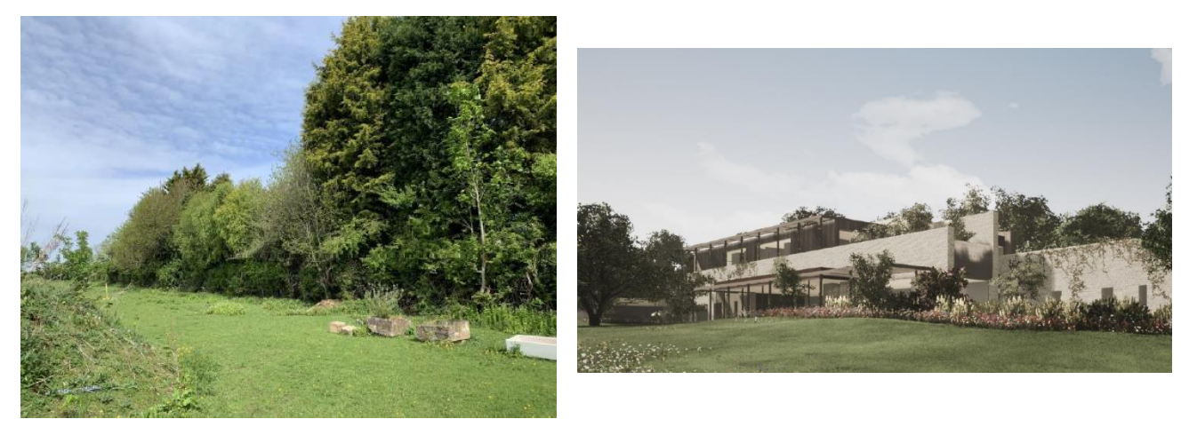
Figure 1 - Site Photo of Southern Boundary from Outside the Site (L) & Visual of Proposed Southern Elevation (R)

Towards the south the closest properties are Fair View and Meadow View which would be in excess of 120m from the side elevation of the proposed dwelling, between which would remain the extensive tree line forming the southern boundary (see site photo below) which, given the height of the existing mature trees (which would mostly remain as part of the scheme), would provide a buffer between these properties and the replacement dwelling.