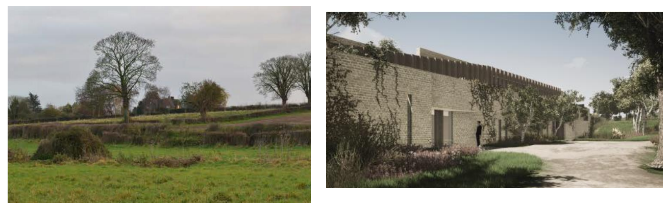
Figure 6 - Site Photo taken from the North of the Northern Boundary with Existing Dwelling (L) & Visual of the Proposed Northern Elevation (R)