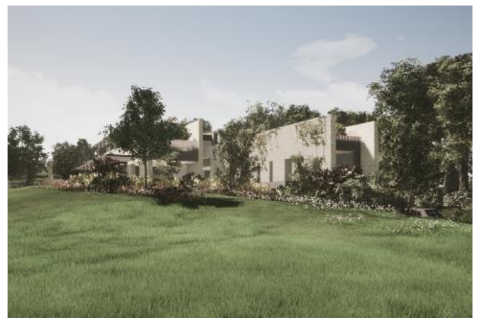
Figure 4 - Visual of Proposed Eastern Elevation

proposed dwelling any visibility of the dwelling would be of the eastern elevation which has glazing panels recessed within the staggered façade as shown in the visual below. It is not anticipated that any adverse amenity impact (including through light pollution) would occur on this occupier or properties directly to the east.